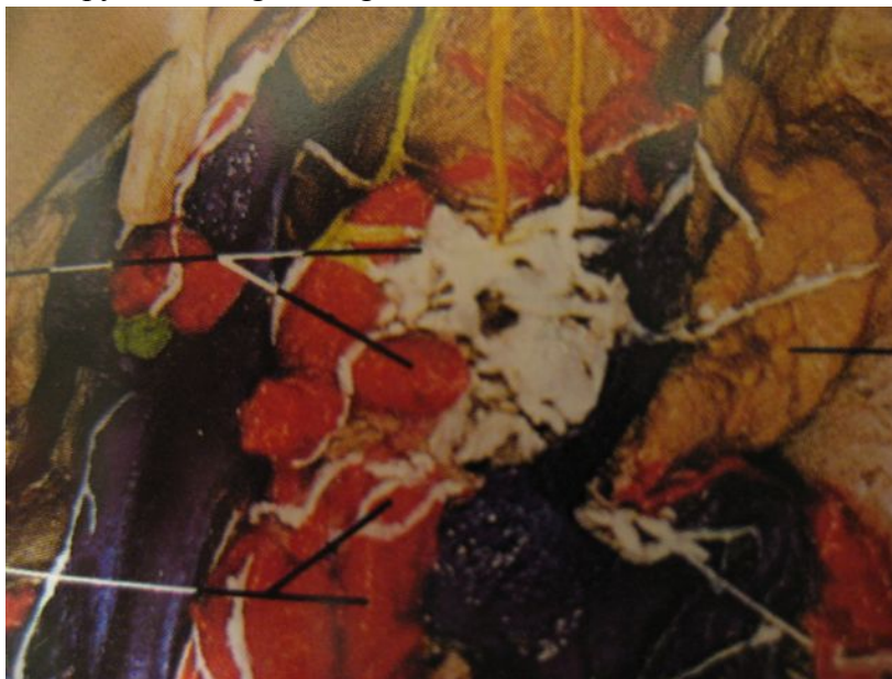
(Celiac Plexus 3)

As levels of Integrin \alpha 5\beta 1 were high in the epigastric region, correlation of Integrin \alpha 5\beta 1 and the celiac plexus was investigated. BDORT showed a significant weakening response between the epigastric region of high Integrin \alpha 5\beta 1 and the celiac plexus in the photographic anatomy of the human body 3) as a reference control substance. Integrin \alpha 5\beta 1 levels in the epigastric region may match those in the celiac plexus 4) because Integrin \alpha 5\beta 1 levels in the celiac plexus should to some degree reflect levels in the stomach, pancreas, liver, and so on. In patients with lung cancer that did not involve the celiac plexus, Integrin \alpha 5\beta 1 reactions were not seen in the celiac plexus. Furthermore, when Integrin \alpha 5\beta 1 reactions were seen in several places, the epigastric region showed the superior direction in many cases, and pharmacotherapy in this region might be effective in such cases.